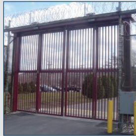
Standard Top track gate