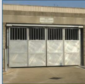
Custom Panel infill options