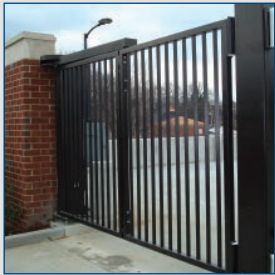
Custom panel infill options