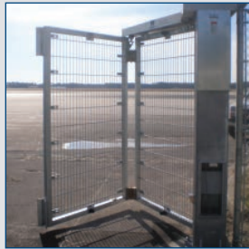
Welded Wire Infill